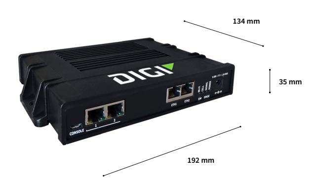
Digi Connect EZ 2