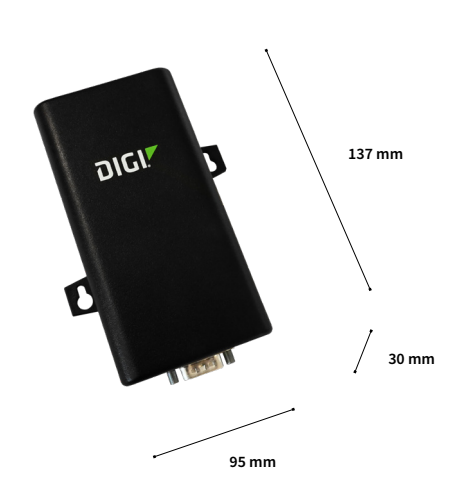
Digi Connect EZ Mini