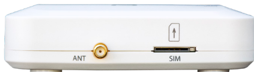
DIGI CONNECT® IT MINI LEFT